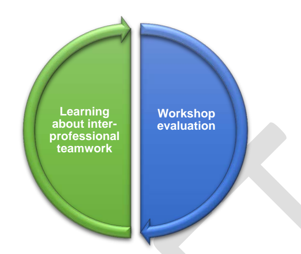
Figure 1: Main Categories of Themes from Data Analysis